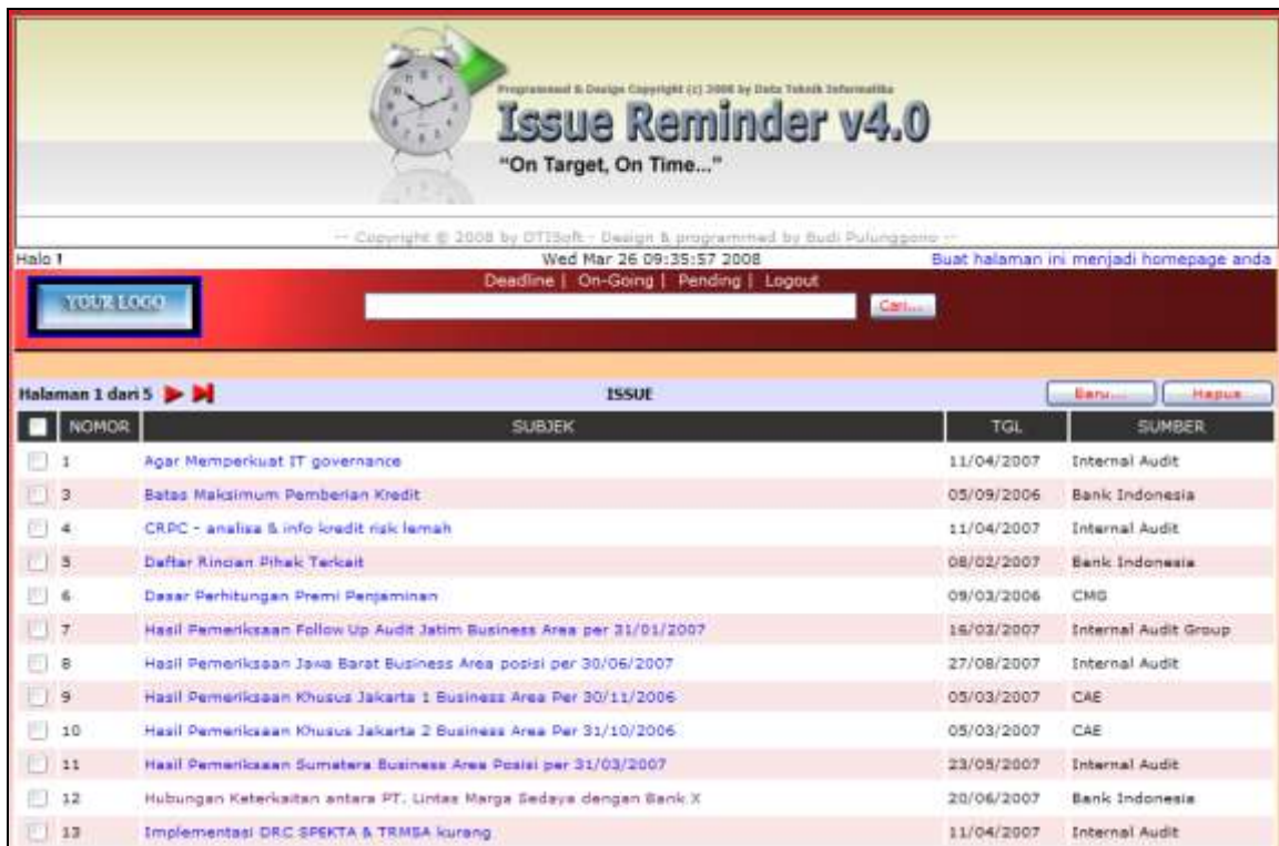
Fig 1. Deadline Issues